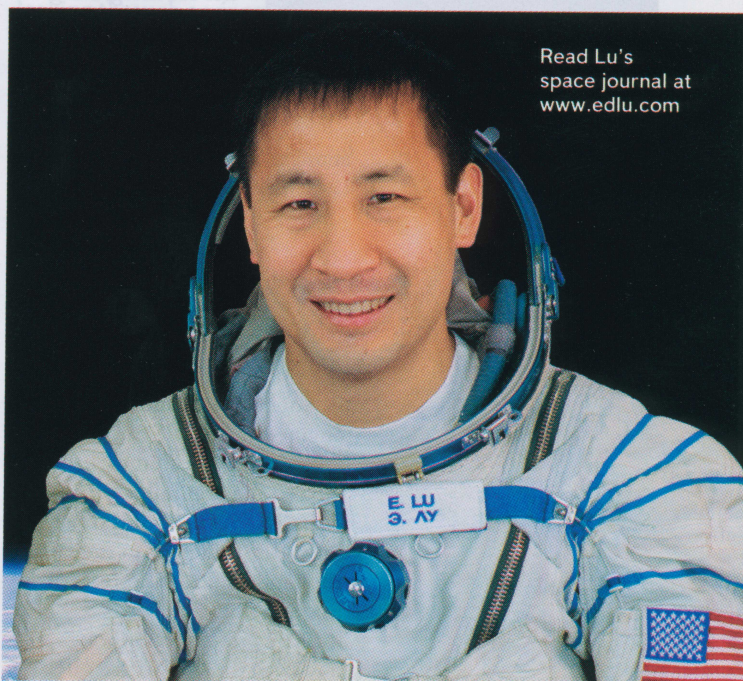
Read Lu's space journal at www.edlu.com